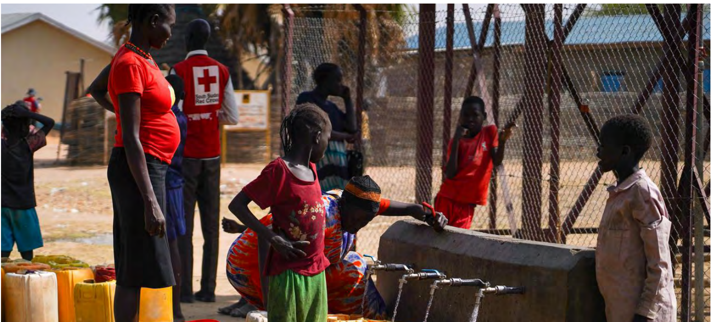
Women and children fetching water at the newly constructed water borehole as part of the IFRC-DG ECHO Pilot Programmatic Partnership in Panthou, South Sudan.

As part of its broader strategy to address the climate crisis, the IFRC provided technical and advocacy support to the South Sudan Red Cross' Go Green Campaign. This includes promoting the Tree Planting and Care initiative , which emphasizes nature-based solutions including regenerative agriculture and climate-smart farming practices to restore ecosystems in rural South Sudan.